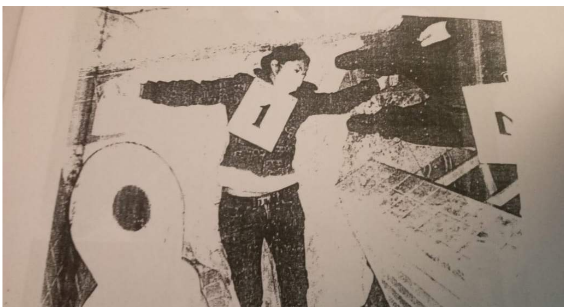
Reconstruction of the crime scene from the expediente.