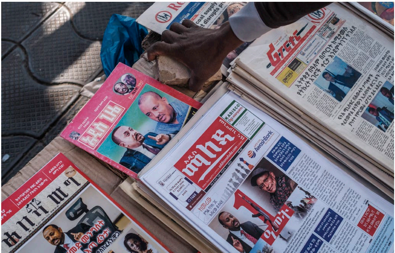
A street newspaper vendor arranges a stone at his stall where local newspapers' covers depict photos of Ethiopian Prime Minister Abiy Ahmed and leaders of the Tigray's People Liberation Front (TPLF) in a downtown area of the city of Addis Ababa, Ethiopia.

With the Policy & Advocacy team we aim to continue our policy and advocacy work to counter the previously mentioned trends and to promote an enabling environment for independent media and journalists. Our main focus areas will still be to advocate for the safety of journalists and to incentivize the prosecution of violence against them and to address the persistent impunity in the cases of murdered journalists. The chairmanship of the Dutch Ministry of Foreign Affairs in 2022 will create opportunities for direct engagement with the Media Freedom Coalition to improve the safety of journalists across the globe. Another platform for our advocacy on this issue is our role in the Media Freedom Rapid Response Mechanism, to raise awareness on media freedom issues in the EU and to advocate for improvements in policy, practice and legislation.