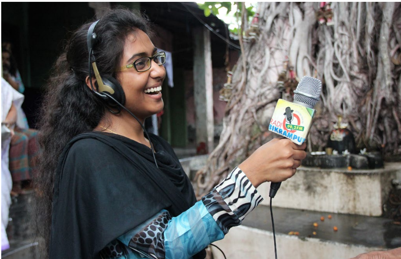
© Paul Enkelaar, Community Radio in Bangladesh.