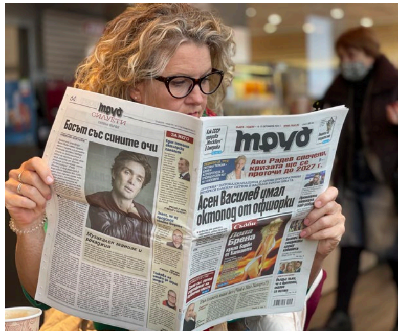
At the gas station in Sofia, Bulgaria a lady reads in the newspaper 'Work'. The title says: 'Asen Vassilev, minister in the Bulgarian government accused of corruption scandal with offshore companies'.

In Syria, where FPU has supported the sector with ethical journalism in the past years, FPU will help strengthen accountability of the Syrian media sector