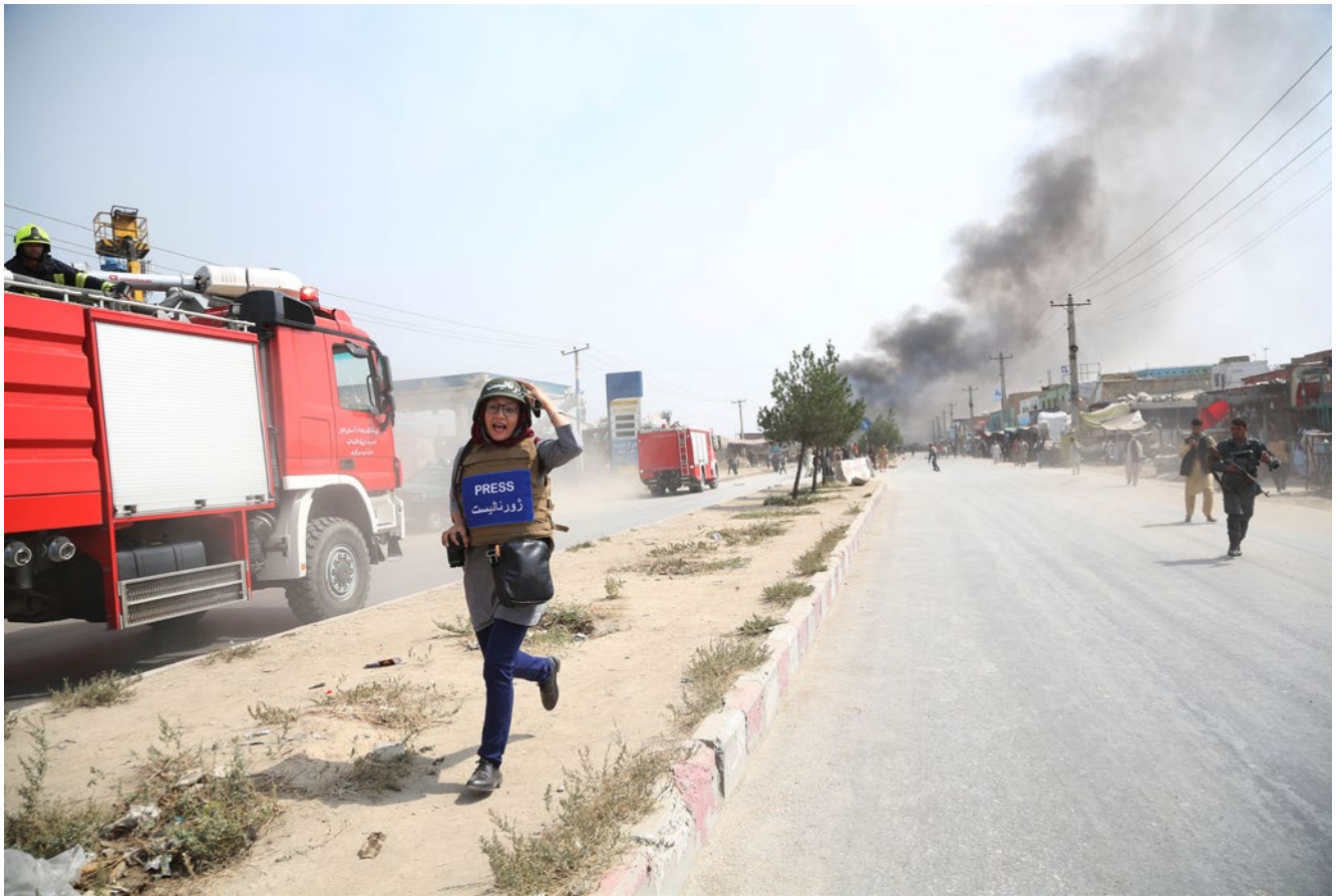
© Hollandse Hoogte/Rahmatullah Alizadah Xinhua /ey, A journalist runs away from the site of a bomb attack in Kabul, capital of Afghanistan.

are expected to result in a media and conflict/peace guide. Under this theme, FPU contributes to SDG 16: Promote peaceful societies.