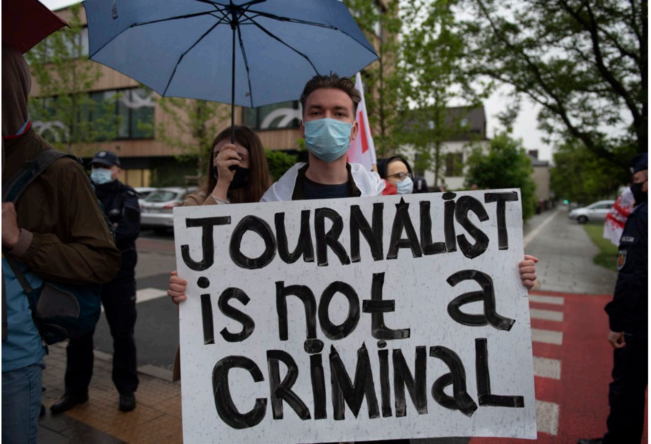
A man holds a placard during a solidarity protest next to the embassy of Belarus in Warsaw, Poland.