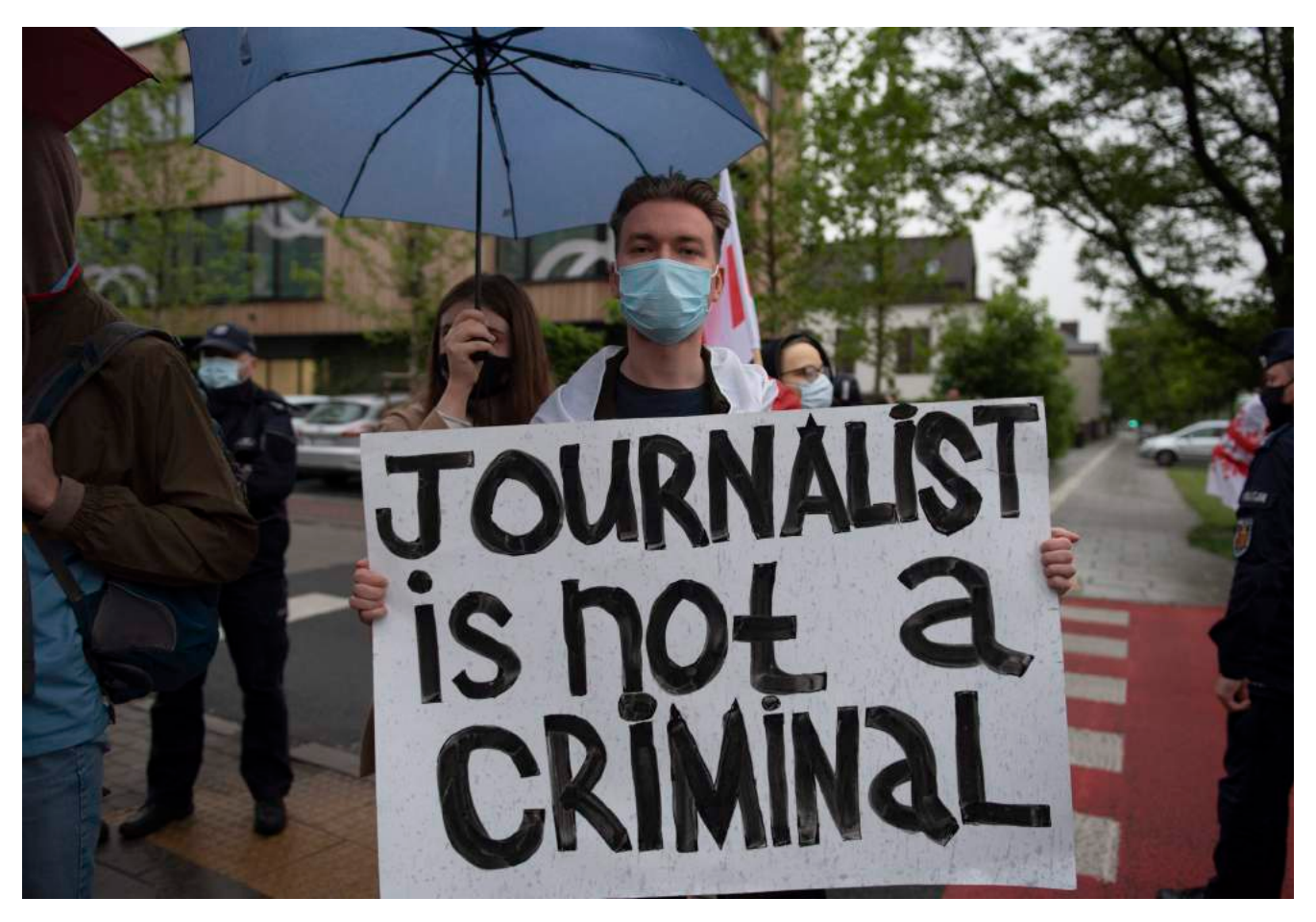
A man holds a placard during a solidarity protest next to the embassy of Belarus in Warsaw, Poland.