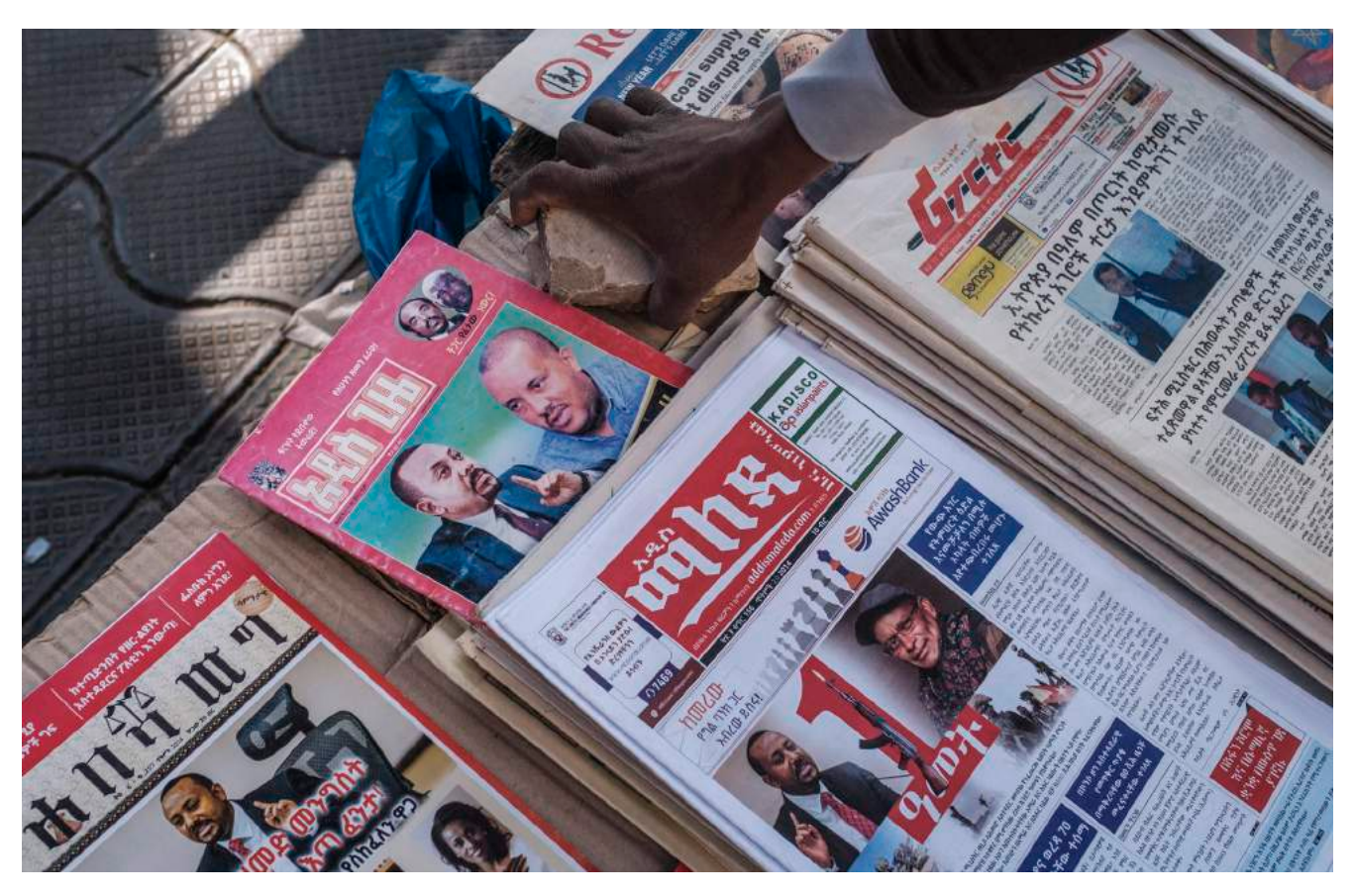
A street newspaper vendor arranges a stone at his stall where local newspapers' covers depict photos of Ethiopian Prime Minister Abiy Ahmed and leaders of the Tigray's People Liberation Front (TPLF) in a downtown area of the city of Addis Ababa, Ethiopia.

With the Policy & Advocacy team we aim to continue our policy and advocacy work to counter the previously mentioned trends and to promote an enabling environment for independent media and journalists. Our main focus areas will still be to advocate for the safety of journalists and to incentivize the prosecution of violence against them and to address the persistent impunity in the cases of murdered journalists. The chairmanship of the Dutch Ministry of Foreign Affairs in 2022 will create opportunities for direct engagement with the Media Freedom Coalition to improve the safety of journalists across the globe. Another platform for our advocacy on this issue is our role in the Media Freedom Rapid Response Mechanism, to raise awareness on media freedom issues in the EU and to advocate for improvements in policy, practice and legislation.