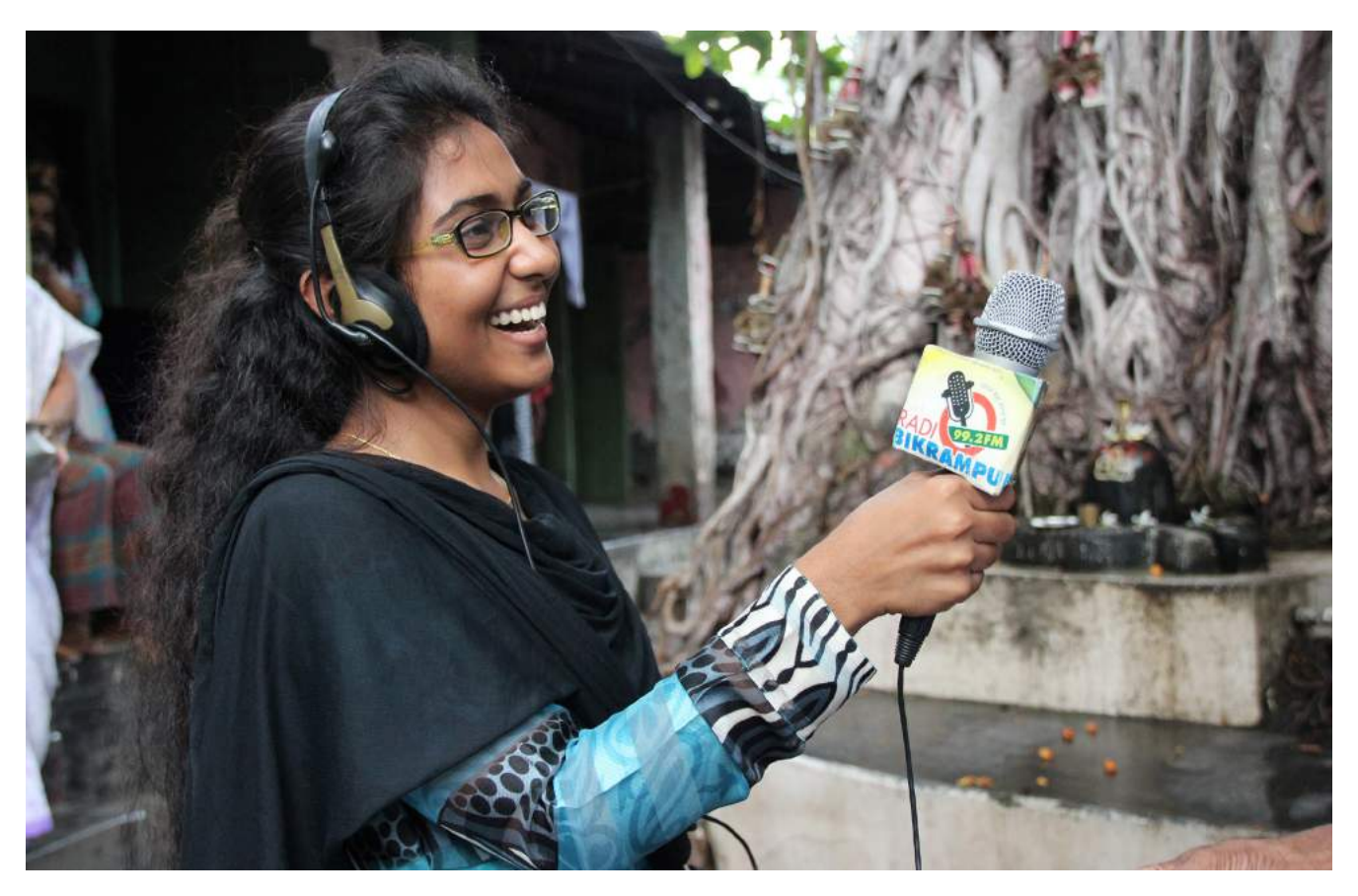
© Paul Enkelaar, Community Radio in Bangladesh.