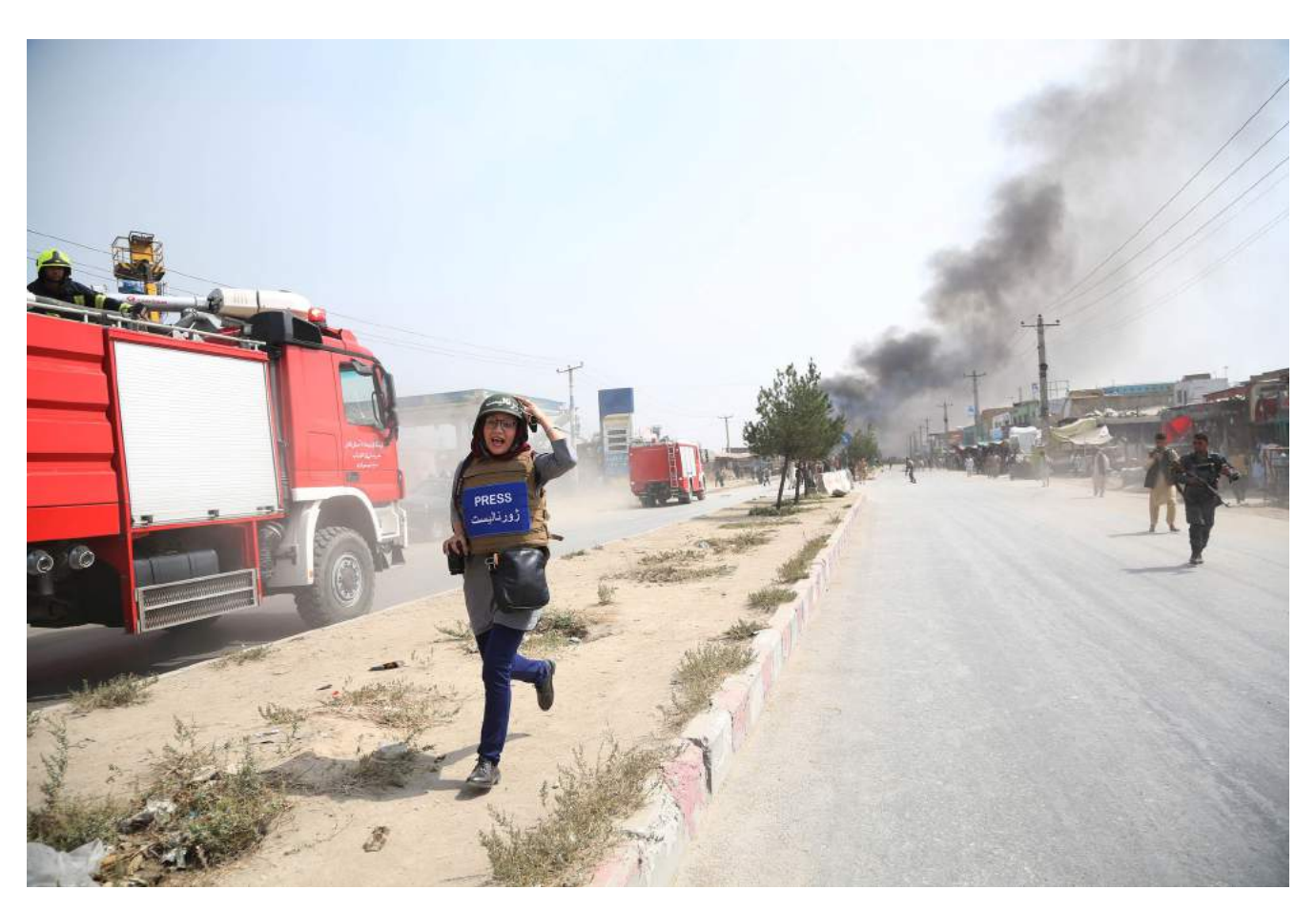
© Hollandse Hoogte/Rahmatullah Alizadah Xinhua /ey, A journalist runs away from the site of a bomb attack in Kabul, capital of Afghanistan.

are expected to result in a media and conflict/peace guide. Under this theme, FPU contributes to SDG 16: Promote peaceful societies.