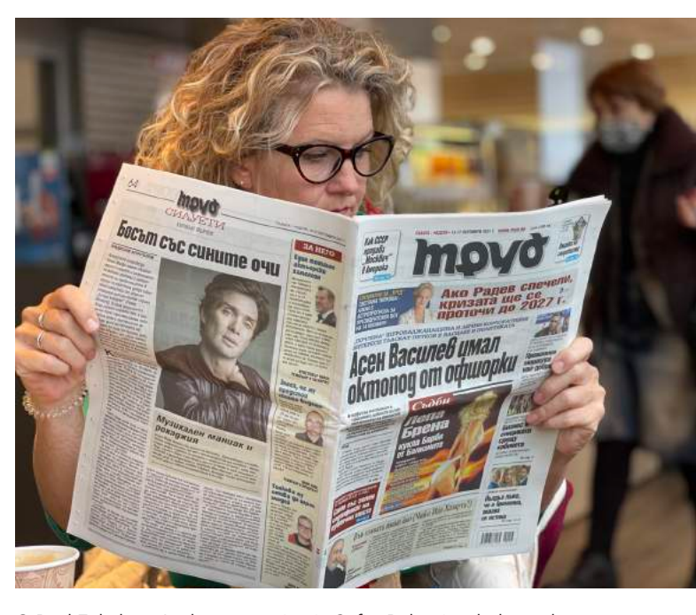
At the gas station in Sofia, Bulgaria a lady reads in the newspaper 'Work'. The title says: 'Asen Vassilev, minister in the Bulgarian government accused of corruption scandal with offshore companies'.

In Syria, where FPU has supported the sector with ethical journalism in the past years, FPU will help strengthen accountability of the Syrian media sector